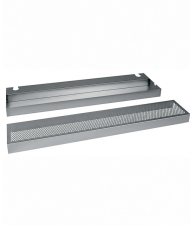
DRIP TRAY W/COVER