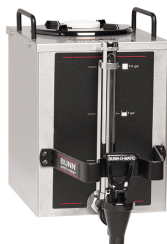
1.5GPR-FF, TOP HNDL