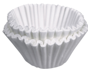
FILTERS,U3 18x7 252CS 252/1 36/CL