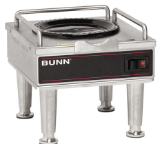
RWS1, 120V-SATIN NKL LEGS